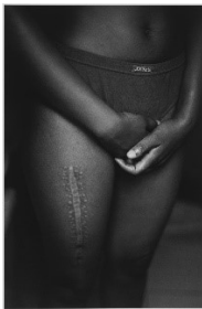
Aftermath , 2004, Silbergelatine auf Papier, Sammlung Tate