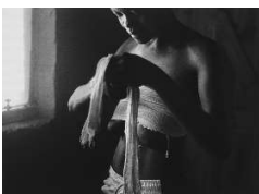
ID-Crisis , 2003, Silbergelatine auf Papier, Sammlung Tate