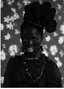
Buhlalu I, The Decks, Cape Town 2019