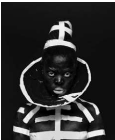
Vile, Gothenburg, Sweden 2015

Courtesy of the Artist and Stevenson, Cape Town/Johannesburg and Yancey Richardson, New York