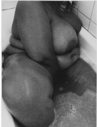
Flesh II , 2005, Silbergelatine auf Papier, Sammlung Tate