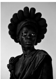
Ntozakhe II, Parktown 2016, Courtesy the artist and Stevenson Gallery, © Zanele Muholi