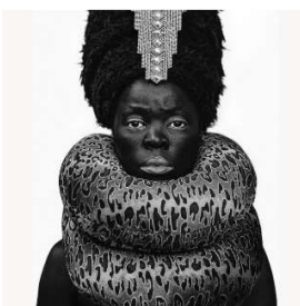
Xiniwe at Cassilhaus, North Carolina 2016