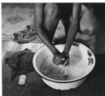
Torture , 2003, Silbergelatine auf Papier, Sammlung Tate