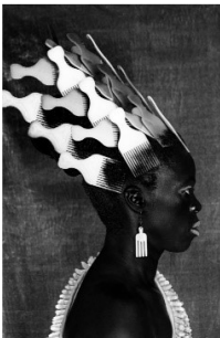
Qiniso, The Sails, Durban 2019

??? 29.04.2020, 10:02: https://www.tate.org.uk/whats-on/tate-modern/exhibition/zanele-muholi