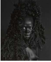
Sonyama IV , Oslo, 2015, Silbergelatine auf Papier, Sammlung Tate